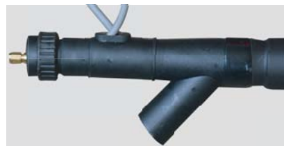
Protection piece with rotatable connector