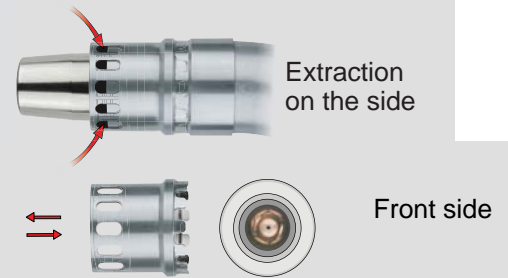
Adjustable extraction piece